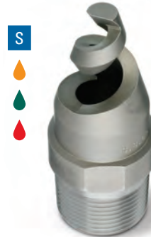
BSJ – 1/4" to 4" male conn. Threaded/Round or flat body style/stainless steel

Custom sizes and other abrasion-resistant materials available. See Quick Reference Guide.