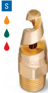
BSJ – 1/4" to 2" male conn. Threaded/Hex. body style/brass