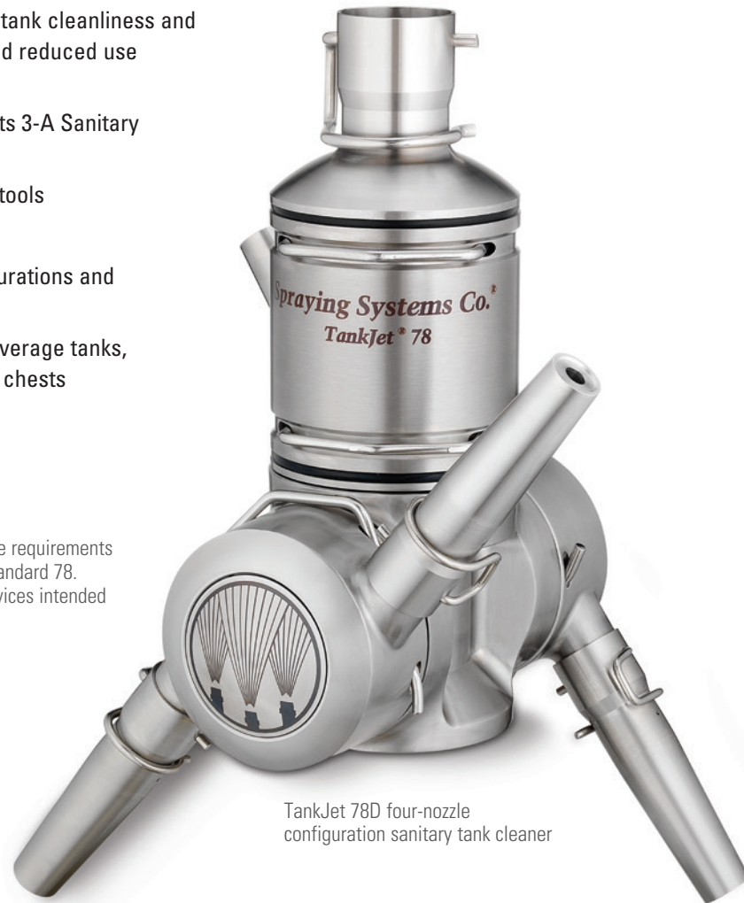
TankJet 78D four-nozzle configuration sanitary tank cleaner

This unit meets the requirements of 3-A Sanitary Standard 78. Spray cleaning devices intended to remain in place.