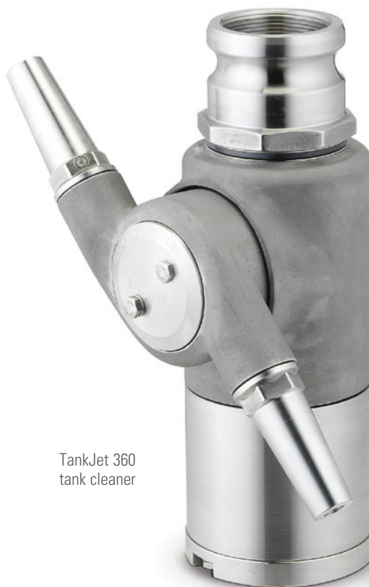
TankJet 360 tank cleaner