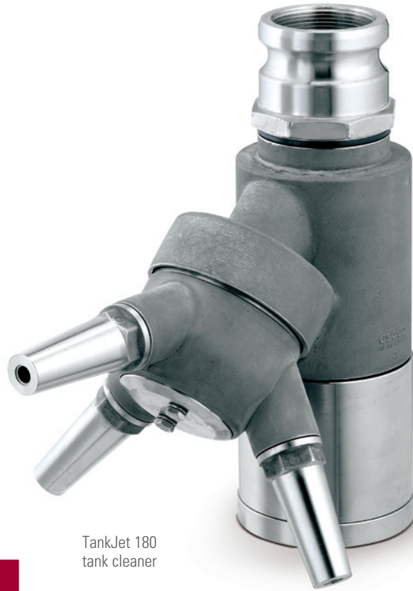
TankJet 180 tank cleaner