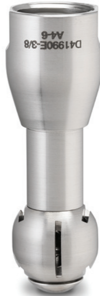
TankJet D41990 tank cleaning nozzle