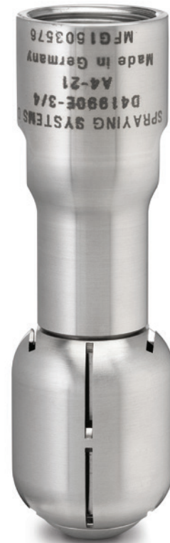
TankJet D41990 tank cleaning nozzle, see page D18

For lances, mounting kits, adapters and more, see page G6