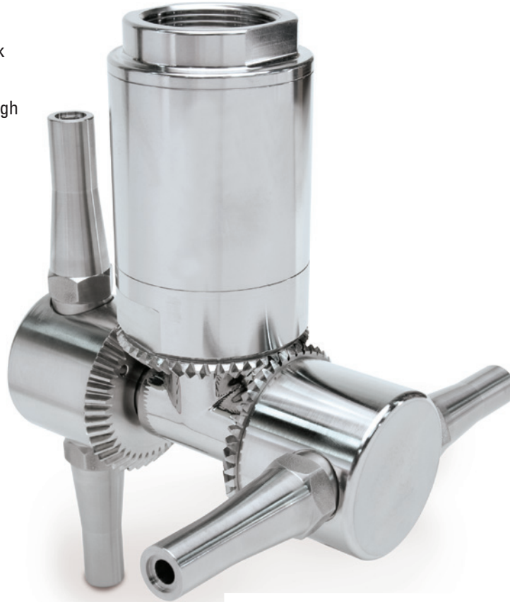
TankJet 65 tank cleaner